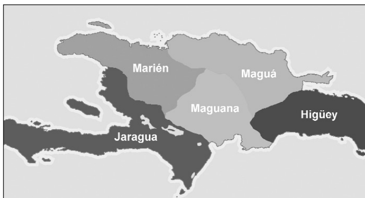
The five caciquedoms (kingdoms) of Hispaniola at the time of the arrival of Christopher Columbus. The modern country of Haiti spans most of the territory of the caciquedoms of Jaragua ("Jaragua" in modern Spanish) and Marien.

Beginning in 1625, French buccaneers became active in this region of the Caribbean. They survived by pirating Spanish ships and hunting wild cattle. Although