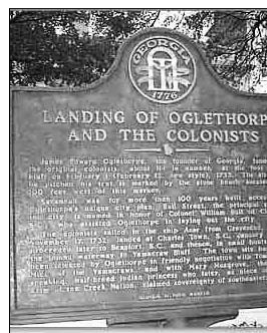
Marker at spot where Oglethorpe landed in Georgia.