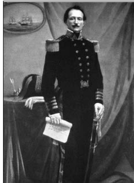
Commodore Uriah Phillips Levy, a great-grandson of Sipra Zipporah Nunez.

It was only natural that Conversos living under such terror would want, if at all possible, to escape to countries where they could openly practice Judaism without fear of retribution. Below is the tale of one Converso family that managed to escape the clutches of the