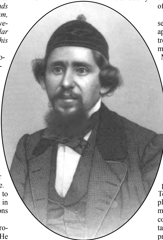
Yisroel ben Yosef Benyamin, known as Benjamin II