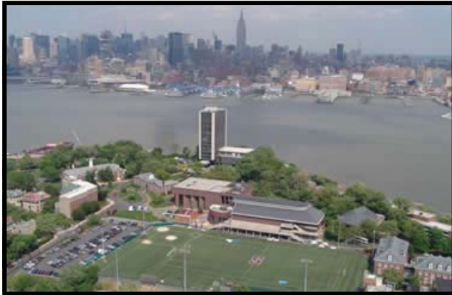
Charles V. Schaefer Athletic and Recreation Center