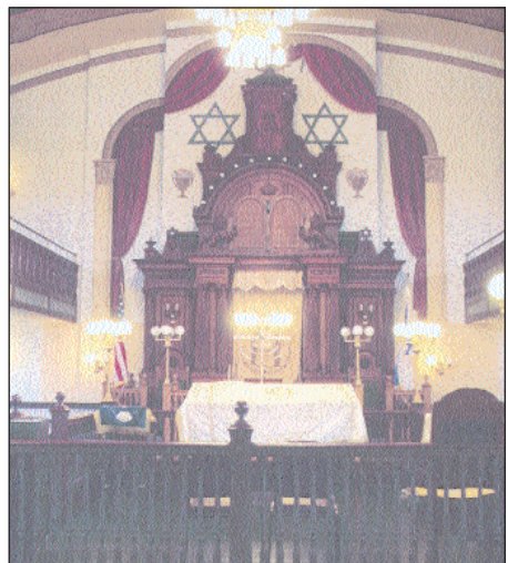
The main shul as seen from the men's section.

This became the largest congregation in Chelsea, and a new shul building on the Wal-