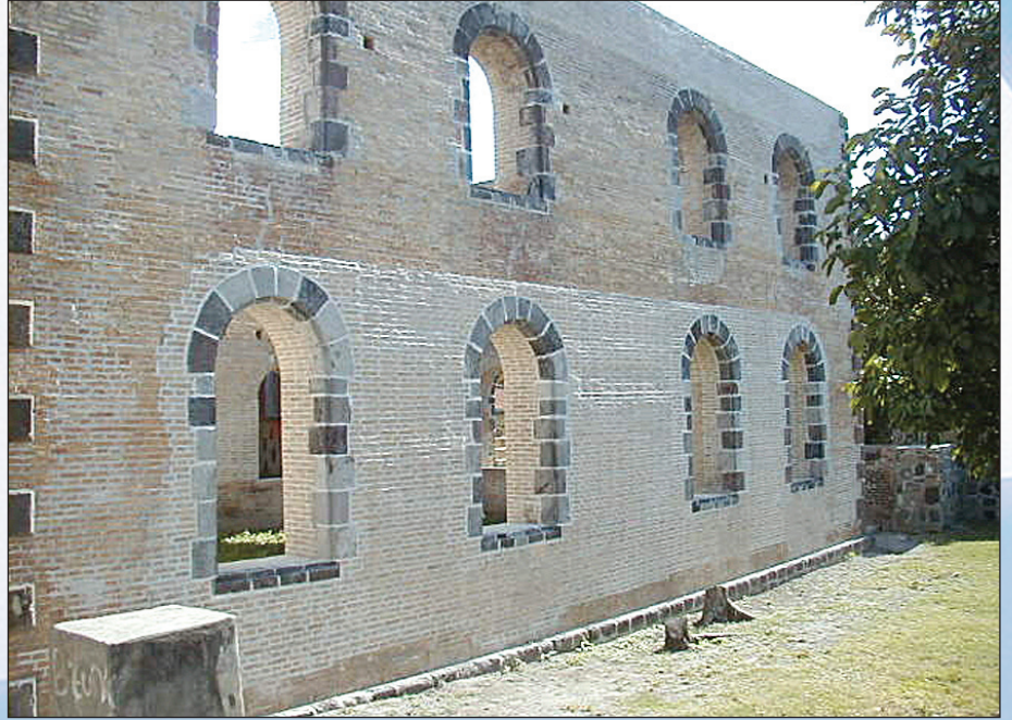
The outside of the Honen Dalim synagogue after it was consolidated in 2002. The structure was strengthened some four years ago as part of the Historic Chore Project.