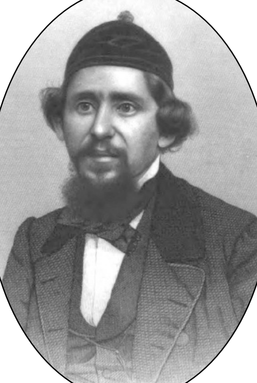
Yisroel ben Yosef Benyamin, known as Benjamin II